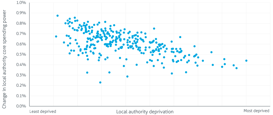
Figure 4 Effect of a 1% increase in council tax on local authority spending power, compared to deprivation, 2019, by local authority