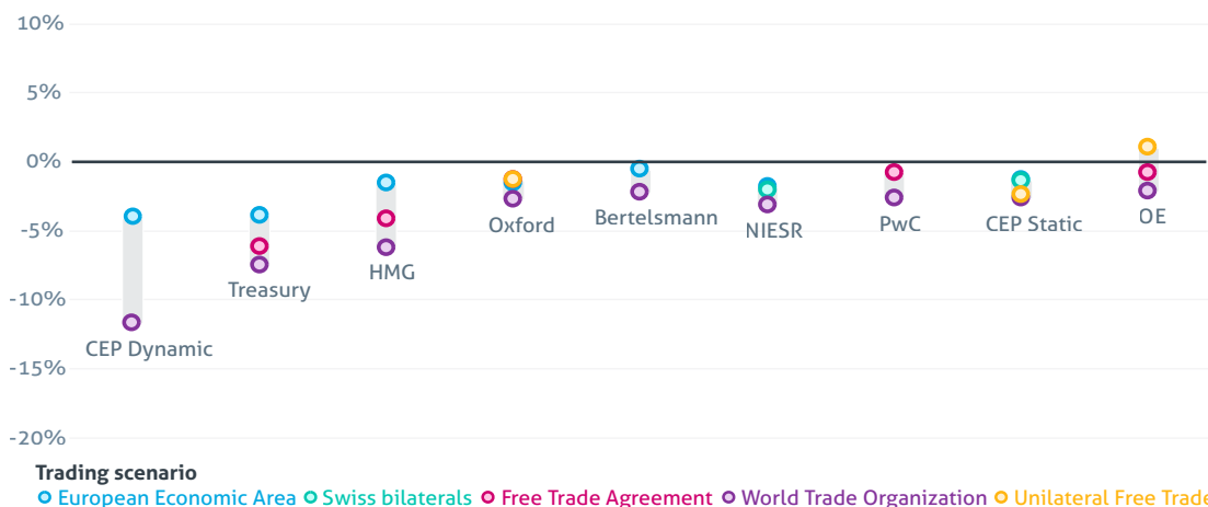
Figure 3: Forecast long-term impact of Brexit on per capita GDP, relative to remaining in the EU

Source: Institute for Government analysis CEP – Centre for Economic Performance, HMG – HM Government, NIESR – National Institute of Economic and Social Research, OE – Open Europe, Oxford – Oxford Economics