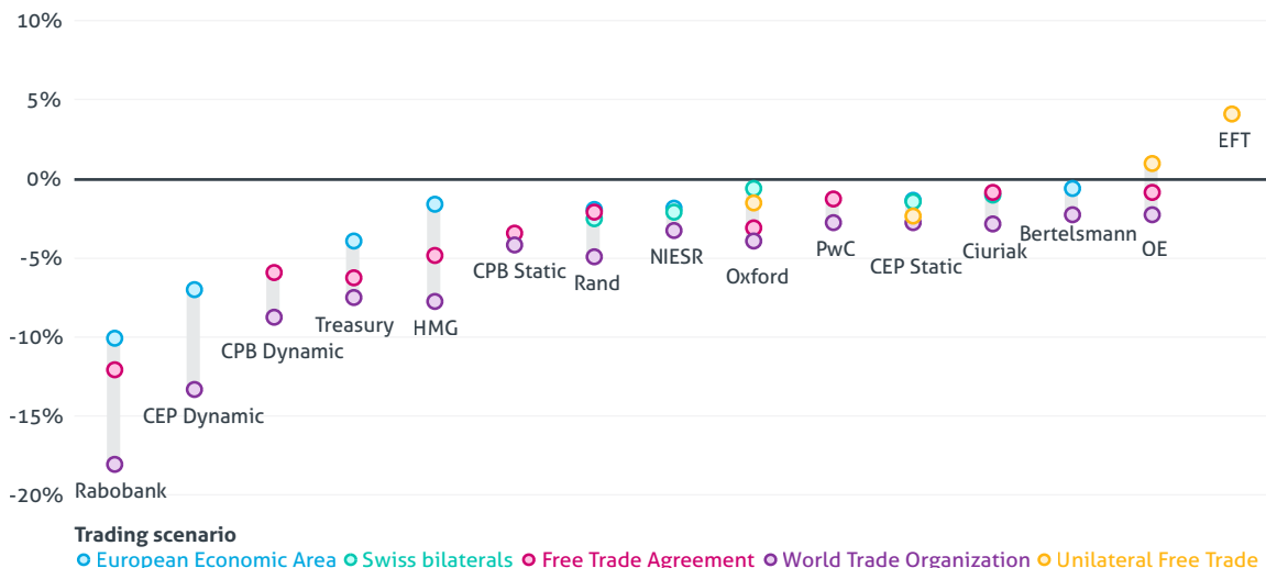
Figure 2: Forecast long-term impact of Brexit on GDP, relative to remaining in the EU